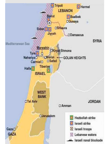
CED's Workshop on Empowering Youth as Environmental Stewards was conducted in Bethlehem just south of Jerusalem, during the political crisis and war.