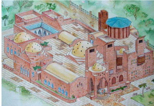
Drawing of an Environmental Center for Bethlehem District. The TEPP initiative will build centers in each Palestinian district in the West Bank and Gaza. The centers will employ experts in environmental education and sanitation services.

Currently CED and TAEQ are leading the TEPP initiative through a series of workshops that includes expert lecturers from Jordan. The DJC encourages learning from regional experts to foster understanding and reconciliation among its neighbors.